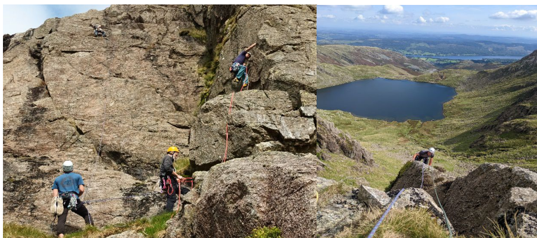
Oreads climbing on Low How.