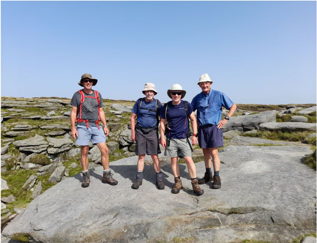
On the top

The last part took us along the Pennine Way path skirting the edge to Kinder Low where statutory photos were taken.