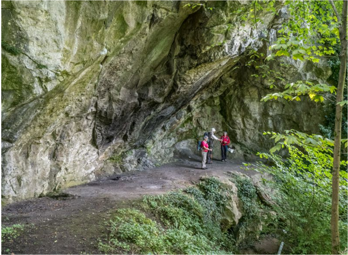
Turkey Dip Rocks.