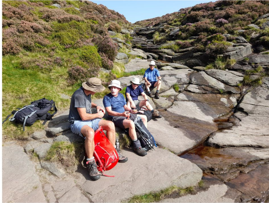
Break by the tower

At 10.00am a group of five intrepid Oreads set out to traverse the Kinder plateaux. From the car park in Barbour Booth we followed the road for a while before setting off up the magnificent valley of Crowden Brook. Some did the scramble and others did the equally difficult “path” which was badly eroded and would be awkward in wet conditions. At the top we stopped for a drink. By now the temperature was rising and it proved to be one of the hottest days of the year. My thermometer showed 25°C on the way back, but other parts of the country had 30°C!!