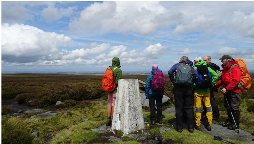
South Yorkshire from Margery Hill.

The forecast for the Sunday was not the best which led to a select group gathering at Fairholmes. We took the track above Mill Brook to reach the tops. We met the crowds on joining the 'main' track up from the carpark. The crowds were soon left when we headed north from Back Tor, but not before one of the team set off finding a quieter route to Margery Hill. We spurned the shelter from the wind while crossing Featherbed Moss for a wind swept scoop below Margery Hill for lunch. But the view was better and the group was reunited!