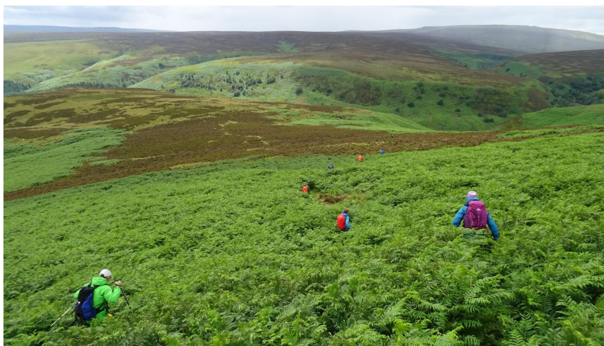
Brian leads the way to the Bullstones cabin.

Bullstones cabin, the consensus was that it would be interesting to do so.