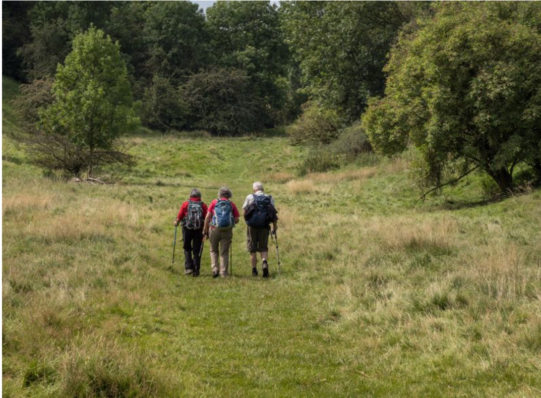
In Wensley dale.